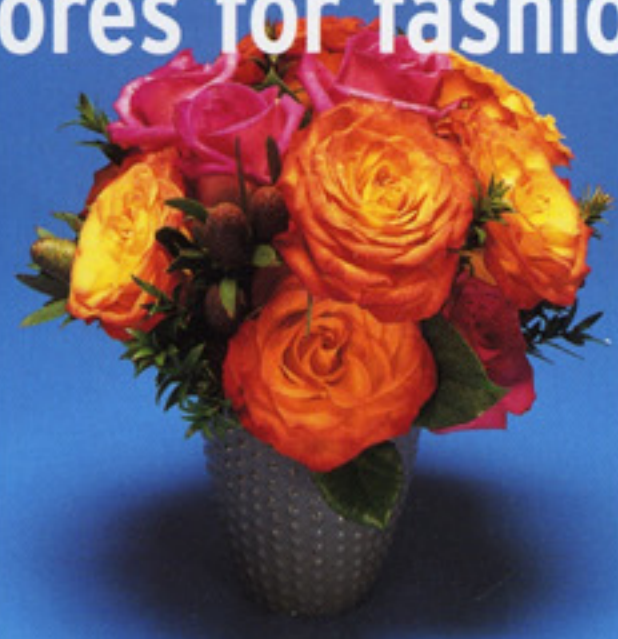
TEATRO VERDE, page 99