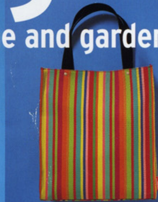
QUASI MODO, page 6