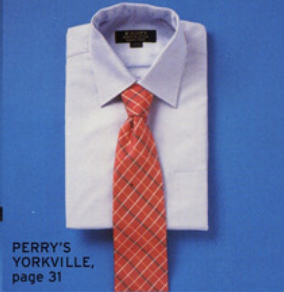
PERRY'S YORKVILLE, page 31